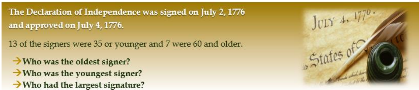
Benjamin Franklin. He was 70 years old; South Carolina's Edward Rutledge. He was 26; John Hancock had the largest signature and he was also the first to sign.

We can discuss your specific situation at your next review meeting, or you can call to schedule an appointment. As always, we appreciate the opportunity to assist you in addressing your financial matters.